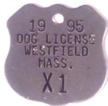
# 120 SHIELD