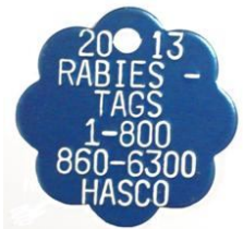
2013 – BLUE ROSETTE