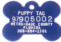
# 110 DOG BONE