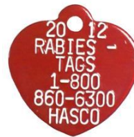
2012 – RED HEART