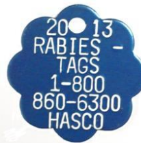
2013 – BLUE ROSETTE