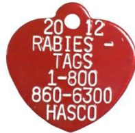
2012 – RED HEART