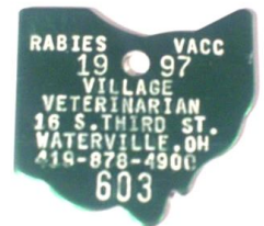
# 994 OHIO