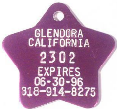
# 174L STAR