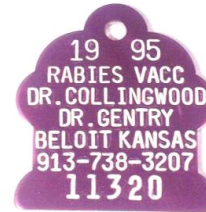
# 143 FIREPLUG