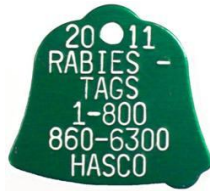
2011 – GREEN BELL