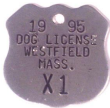
# 120 SHIELD