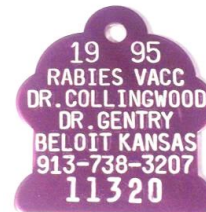
# 143 FIREPLUG