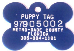
# 110 DOG BONE