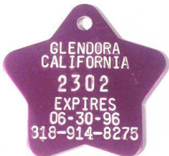
# 174L STAR