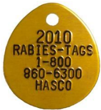
2010 – ORANGE OVAL