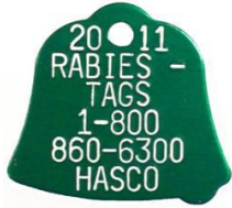
2011 – GREEN BELL