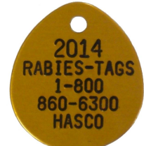
2014 ORANGE OVAL